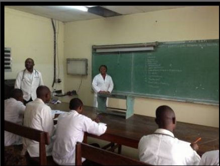
Saturday morning medical conference at Good Shepherd Hospital

As Pastor Mboyamba explained, Congo's families are living at the margins, with little room to cope with adversity. Illness and injury can easily drive them into unsurvivable poverty. At the same time poverty itself increases the risk that they will be injured or become ill, and once they fall ill they will not have money to pay for care and will be unable to seek medical attention. Pastor Mboyamba says that health care ministries are vitally important because " in the Congo it is easy to die—but hard to stay alive. "