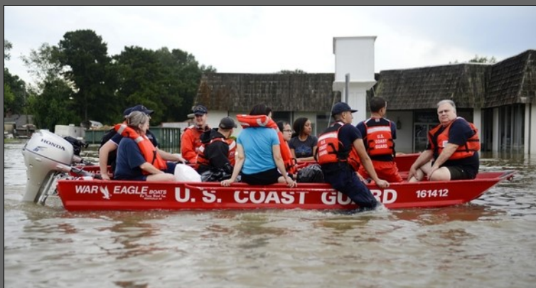
Stranded residents are rescued in Baton Rouge, LA on Aug 14, 2016

Donations are being accepted to help the flood devastation in Louisiana. Checks can be made out to First Presbyterian Church Huron with a notation on the check for flood relief . Pray for families impacted by flooding, for first responders, and for the communities as they work to rebuild.