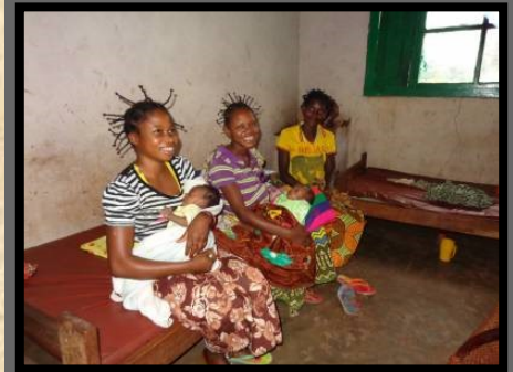
Happy mothers with children at Moma Hospital