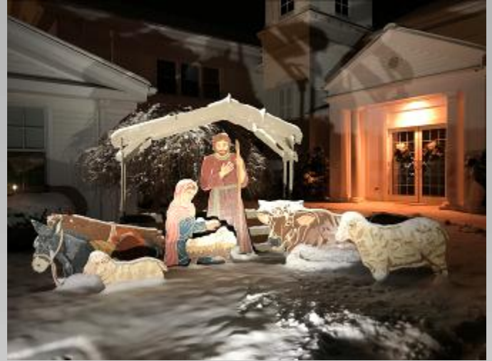
O Holy Night!