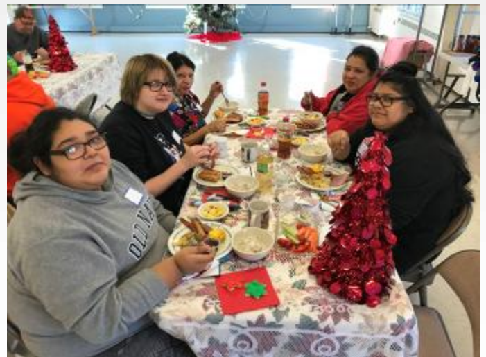
These are the ladies who brunch!