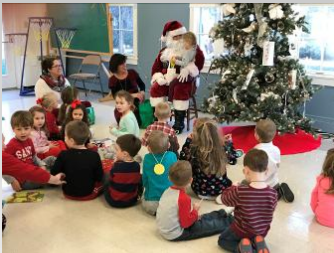
Every child shared secrets with Santa.