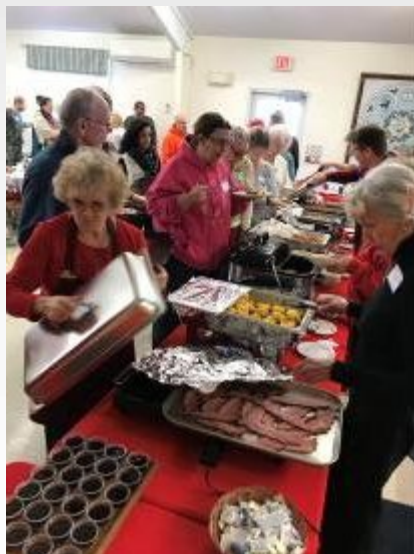
43 folks came through the Christ's Meal Christmas Day Brunch Line!