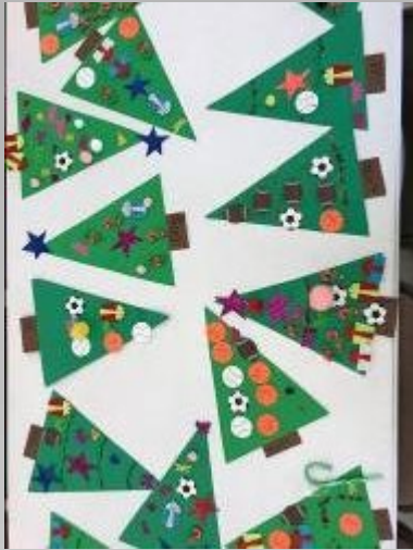
Little, Wonderful Handmade Christmas Trees!