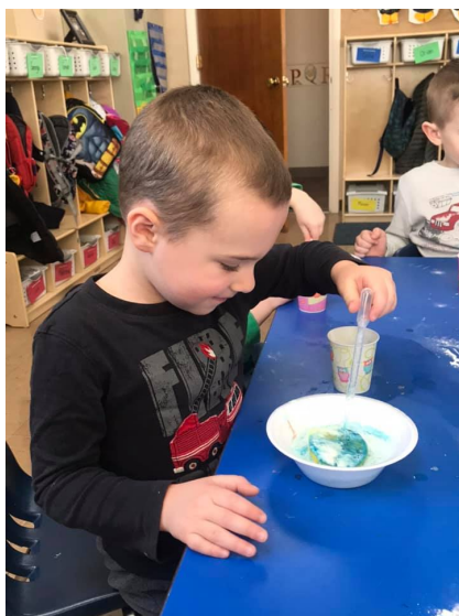
Pictured above and to the right: The students experimented with lemons, baking soda, food coloring, and dawn dish soap to make erupting lemons.