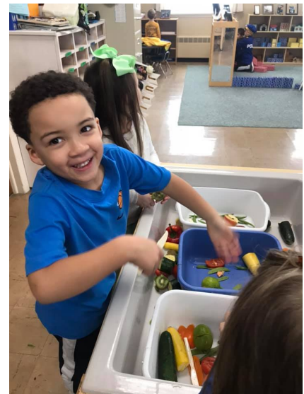
Pictured in the above three photos: The class read the book “The Tiny Seed” by Eric Carle. Afterwards, the students got to investigate various fruits and vegetables by finding the seeds within them.