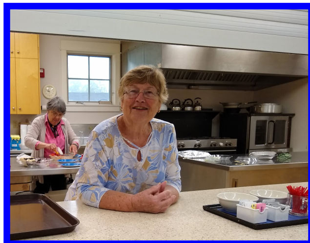
Father's Day: N&M provided delicious pies for a special reception following worship.