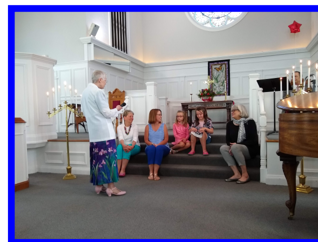
Children's Message during the Worship Service on June 23rd.