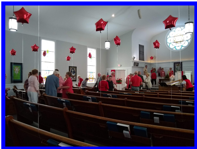
Pentecost Sunday: The sanctuary was decked out with red balloons, and members were encouraged to wear red.