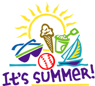
Beautiful summer day!