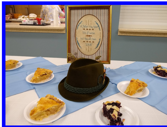
A variety of pies were served at the Father's Day Reception.