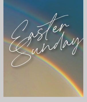
Sunday April 4