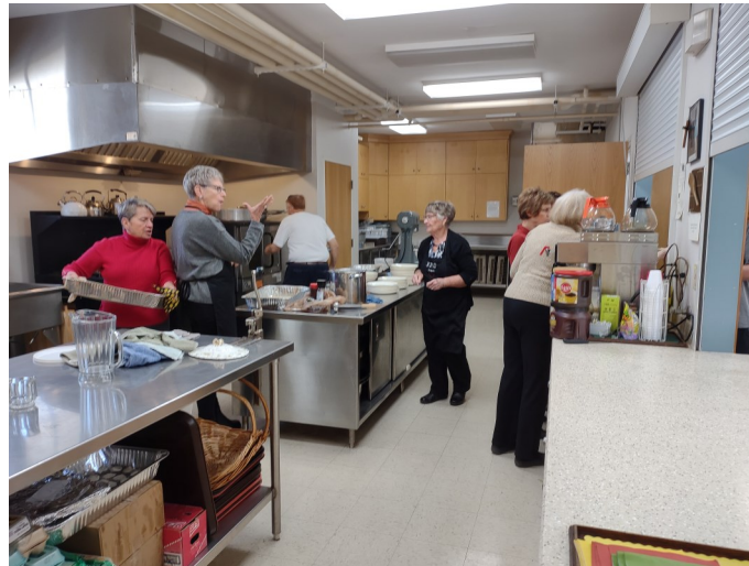
Above: Our busy workers getting ready for the Thanksgiving meal.

We are pleased to offer to anyone one of our older chairs. You may pick them up in Fellowship Hall, while supplies last.