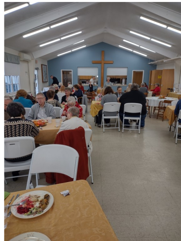
Right: The fellowship enjoys the meal together. Please note the beautiful new chairs that will help us better serve our community. Thank you to the Schlink Foundation for their generous grant.