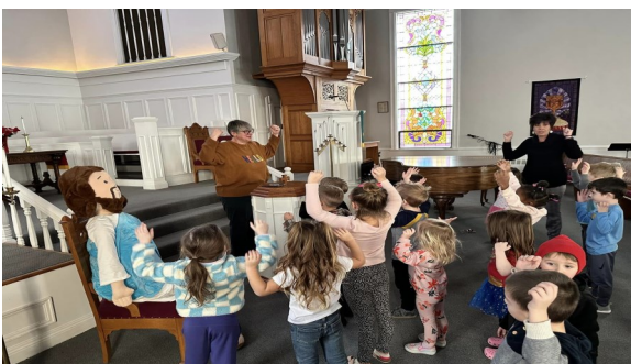
Our Little Wonders in Chapel, and learning imagining about space.